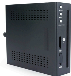
DVD Module: PD251-005