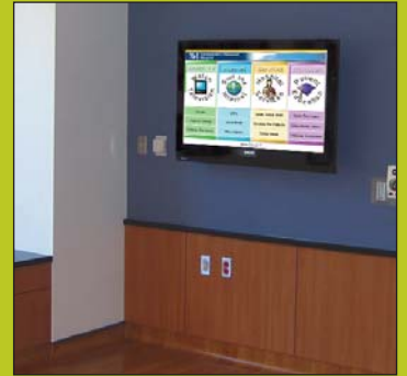
42-inch LCD televisions with TigrNet interactive system, as installed by TeleHealth Services at Northwestern Memorial Hospital.